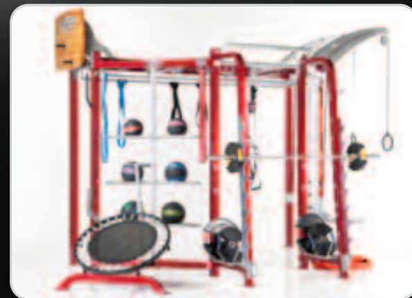
Shown with CT-8210, CT-8220 training modules and CT-8310 Squat/Press Racking Station

The CT Fitness Training System comes in various configurations and options. Call your sales representative to customize your choice of training modules, options and accessories, availability and costs.