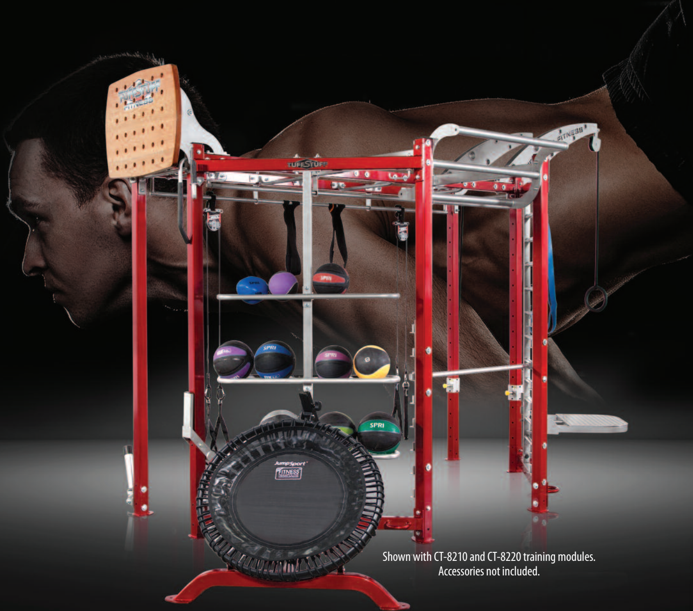
Shown with CT-8210 and CT-8220 training modules. Accessories not included.