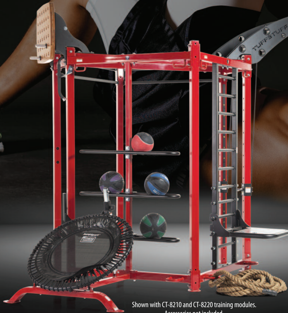
Shown with CT-8210 and CT-8220 training modules. Accessories not included.