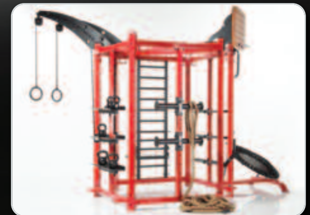
Shown with CT-8210, CT-8220, CT-8230 and CT-8240 training modules

The CT Fitness Training System comes in various configurations and options. Call your sales representative to customize your choice of training modules, options and accessories, availability and costs.