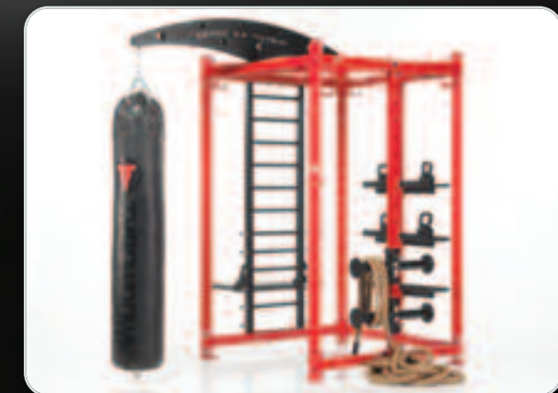
Shown with CT-8220, CT-8230, CT-8240 and CT-8250 training modules