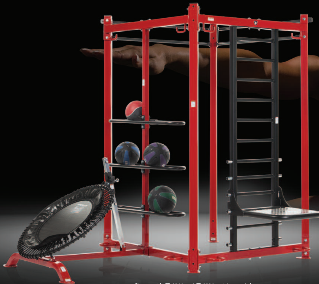
Shown with CT-8210 and CT-8220 training modules. Accessories not included.