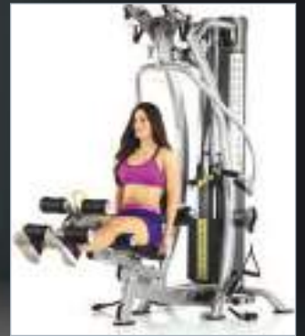
Pictured above are some of the over 30 exercises that can be performed on the SXT-550.