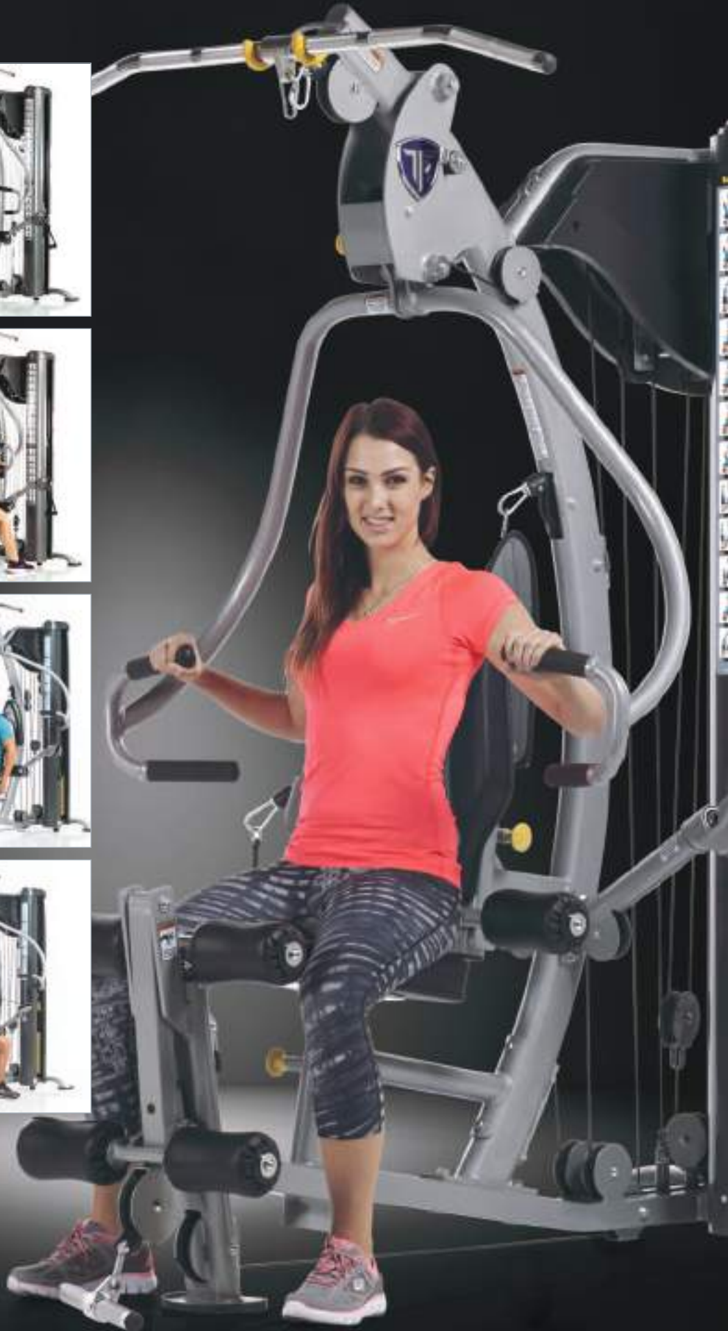
Pictured above are some of the over 20 exercises that can be performed on the AXT-225R.